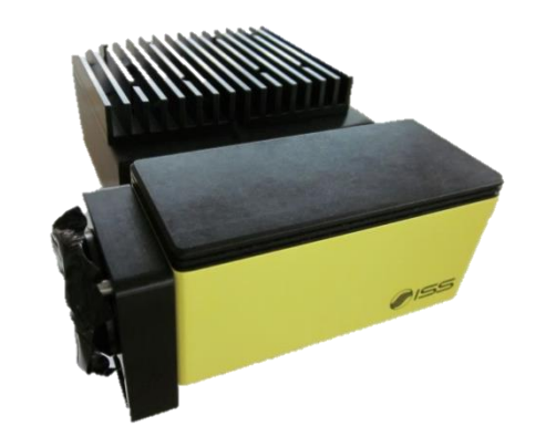
Figure 4.1 Dual-in line H7422P PMT; the unit includes a dichroic for the separation of the incoming beam and filters in front of each detector.