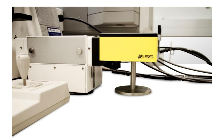
Figure 4.2 Two GaAs PMTs Model H7422P-40 installed on the NDD port of the LSM 780 microscope. The unit includes a dichroic for the separation of the incoming beam and filters in front of each detector.

Two-detector units (PMT Model R10467U) coupled to the non-descanned detection (NDD) port of the LSM 780 system. The two detectors are positioned perpendicularly with respect to each other.