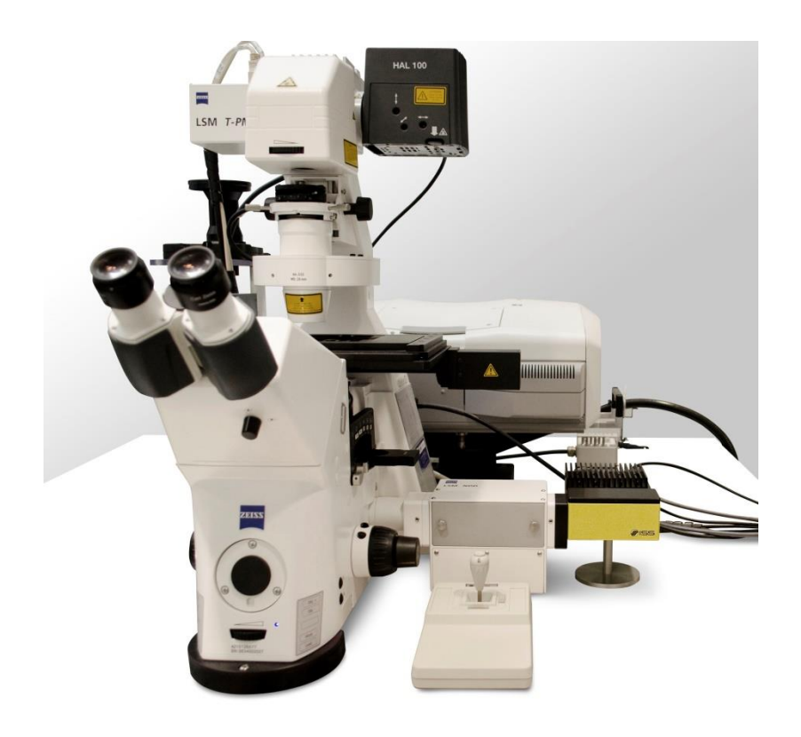
Figure 1.1 Model LSM780 confocal microscope. The ISS detector(featured on the right section / yellow color) is added to the NDD port

The upgrade package requires an attentive selection of four key elements: